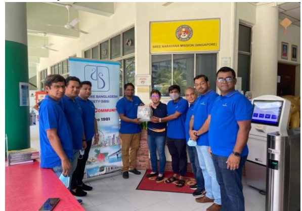
Visiting Old age home- Shri Narayana Mission