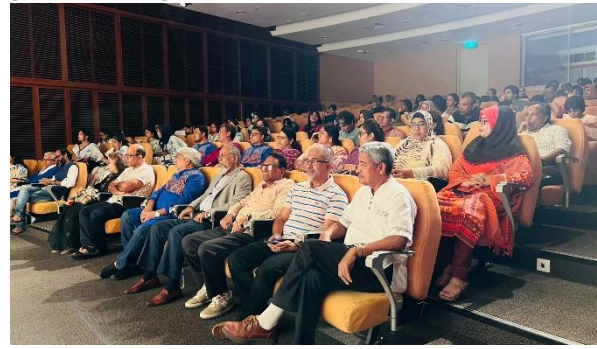
SBS-CFA Certificate Awarding ceremony & Cultural Show