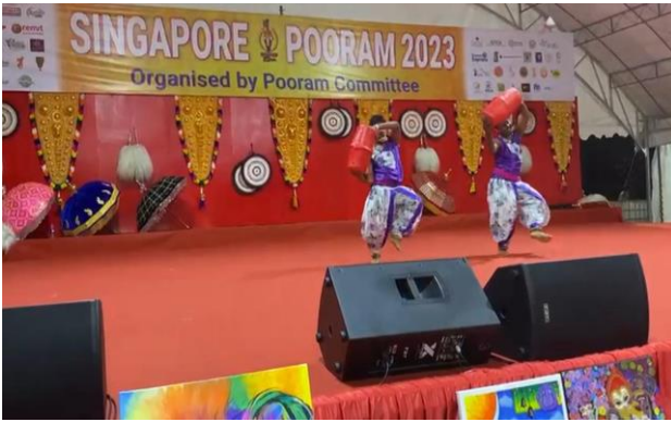
Participation in Singapore Pooram