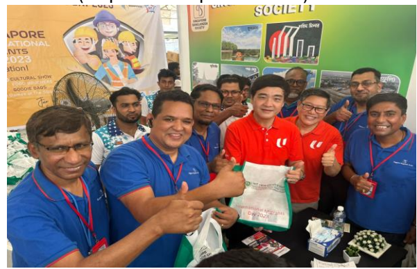
International Migrants Day 2023 ( In partnership with MOM)