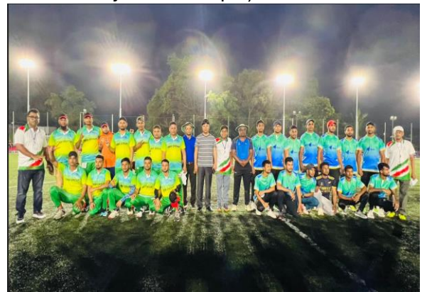
International Migrants Cricket Tournament 2023 ( In partnership with MOM)