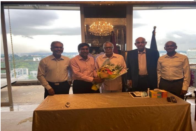
Meeting with President of Bangladesh