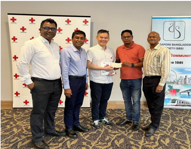
Donation for Turkey earth Quake Victrom