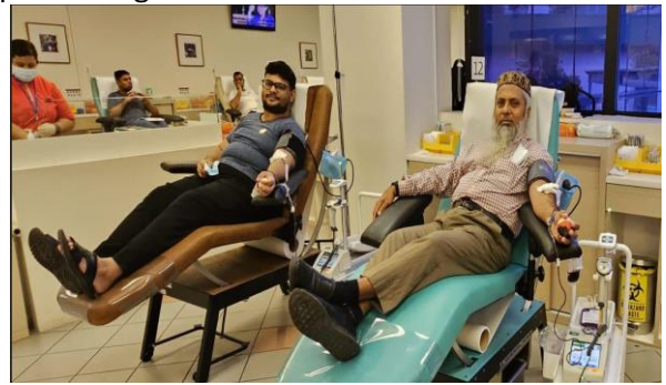
Blood Donation Drive 2023