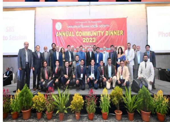
Annual Community Dinner 2023