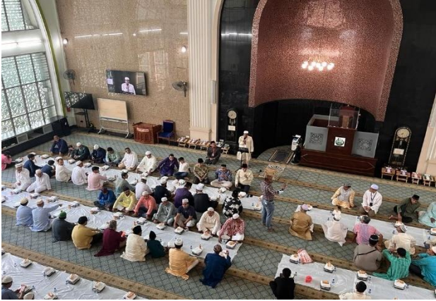
SBS Grand Iftar 2023 ( With Support from Assyakirin Mosque)