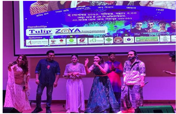
Cultural Night 2023