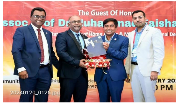
Unveiling of Bi-Annual Magazine “Rangdhonu”