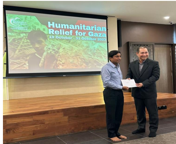
Donation for Humanitarians Aid for Gaza